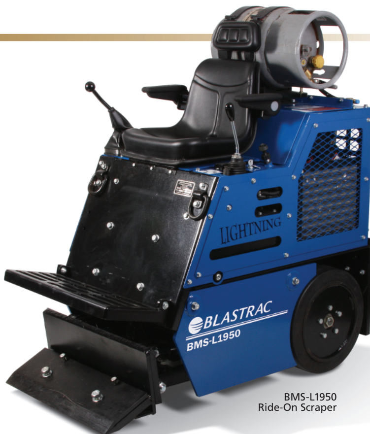
BMS-L1950 Ride-On Scraper

The BMS-L1950 ride-on scraper brings you the quality and durability you can trust, that is the hallmark of Blastrac.